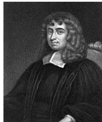
The lunar crater “Barrow” is named after Isaac Barrow. The Wheel Barrow is not.

We've learned two different branches of calculus so far: differentiation and integration. Finding slopes of tangent lines and finding areas under curves seem unrelated, but in fact, they are very closely related. It was Isaac Newton's teacher at Cambridge University, a man named Isaac Barrow (1630 – 1677), who discovered that these two processes are actually inverse operations of each other in much the same way division and multiplication are. It was Newton and Leibniz who exploited this idea and developed the calculus into its current form.